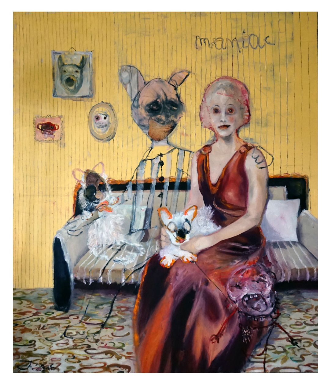
'Maniac' 2016 160 x 140 cm Mixed Media on Canvas

Whilst yielding many interpretations, Hundertmark's work is primarily concerned with psychoanalysis. Her imagery is an improvised dance in the subconscious, conjuring people and creatures out of childhood memories and placing these strange characters in even stranger relationships.