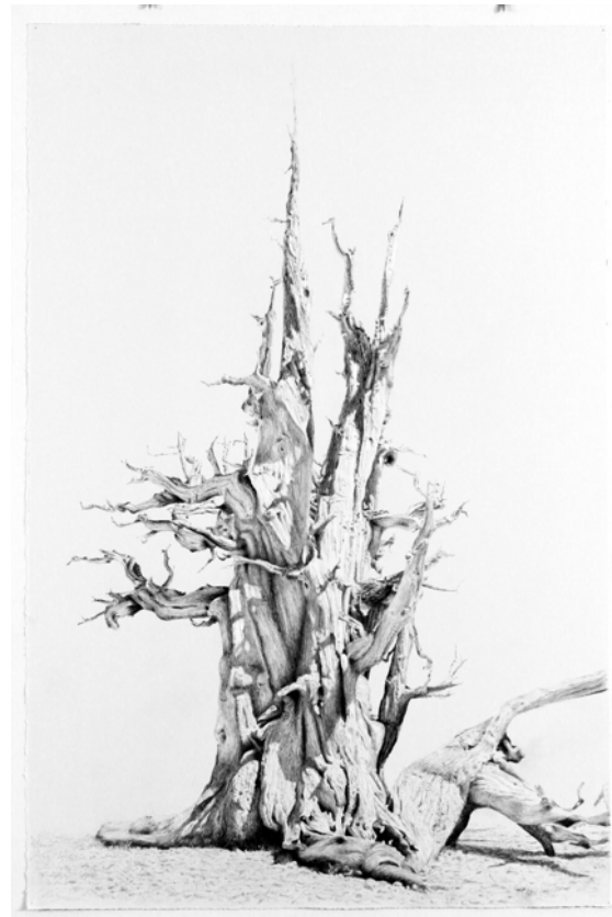
Anders Knutsson, Bristlecone Pine , Pencil on paper, 2006, 102 x 66 cm