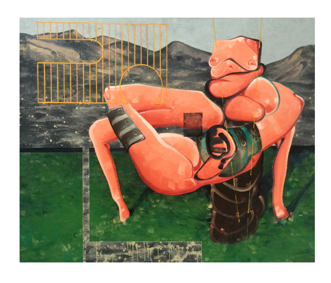
Evren Sungur 'Organik Machine' 2015, Oil on canvas, 167 \times 200 \text{ cm}