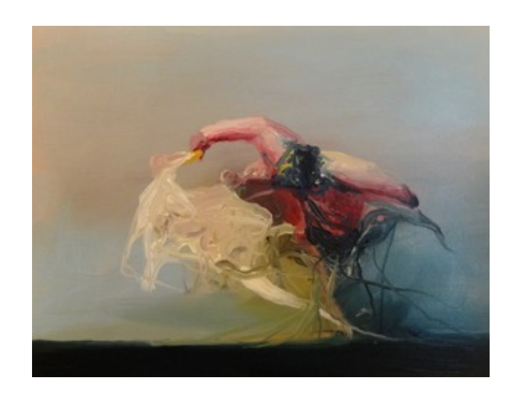
Iuliane Hundertmark 'Breakfast No.5' 2016, Mixed Media on Canvas, 150 x 170 cm