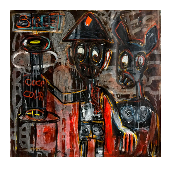
Aboudia 'Coca Cola' 2016, Mixed media on canvas, 180 \times 180 cm

Sungur achieves a distinctive texture through vigorous, confident application of oils. This texture gives each work a tangible sculptural nature, lending the work a formality. Sungur's exploration of the psychological aspects of everyday events has been divided into two main series; Organic Machine & One Night Stand.