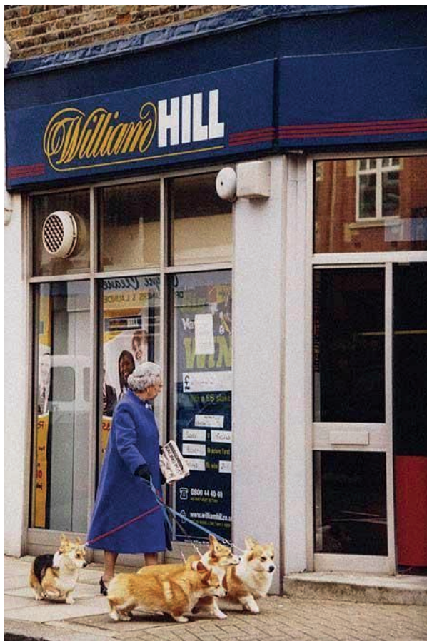
Alison Jackson 'Queen At William Hill'